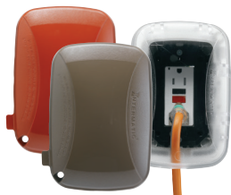
In-Use Weatherproof Cover