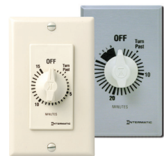
Spring Wound Countdown Timers